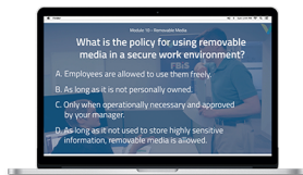
Character-Animated Interactive Scenarios